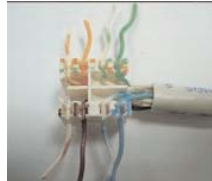
6. Untwist and sort the conductors into the wire slots according to the color code.