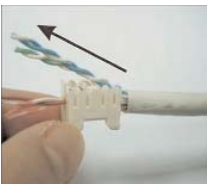
4. Guide the conductors through the wire path.