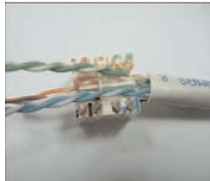
5. Push the cable gently until it cannot move any further.