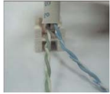
3. Insert the conductors from the rear of the wiring block according to the engraved color ID.