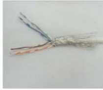
2. Roll back the copper braid when stripping the cable.