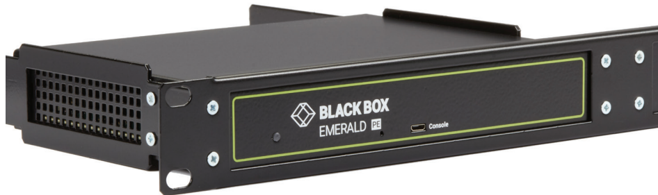
FIGURE 3-3. INSTALL THE ASSEMBLED PE UNIT

3. To install the assembled PE unit, use (4) M3 screws to secure the plate to the rack bracket.