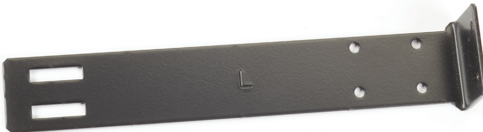
FIGURE 3-4. SE MOUNTING BRACKET

4. To install an Emerald SE, secure the mounting brackets to either side of the unit using (4) M3 screws. There are two brackets provided, one marked "L." Attach this bracket to the left side of the SE unit (as you look at the unit from the front).