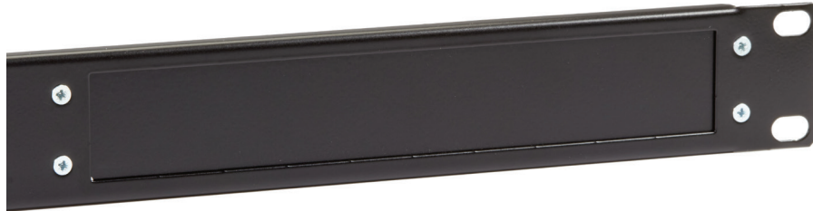
FIGURE 3-1. BLANKING PLATE