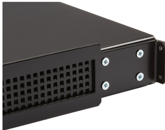
FIGURE 3-2. INSTALL THE MOUNTING BRACKETS TO THE EMERALD PE UNIT