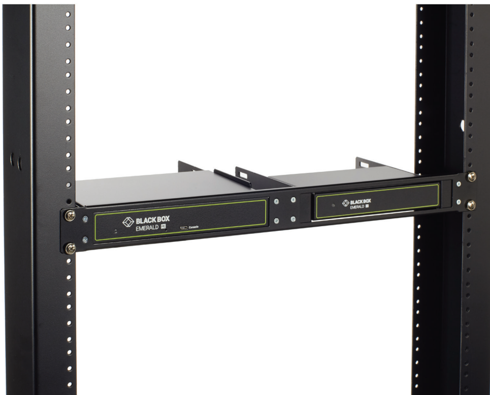
FIGURE 3-6. FINAL ASSEMBLY SECURED TO RACK

7. Use the cage nuts and screws provided to secure the bracket assembly to the rack.