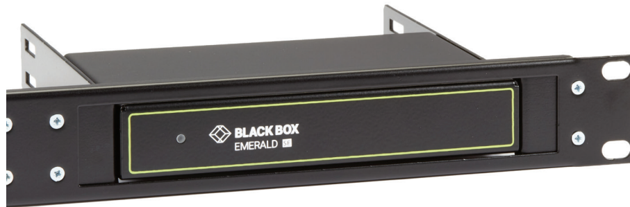
FIGURE 3-5. INSTALL THE ASSEMBLED SE UNIT

5. To install the assembled SE unit, use (4) M3 screws to secure the plate to the rack bracket.