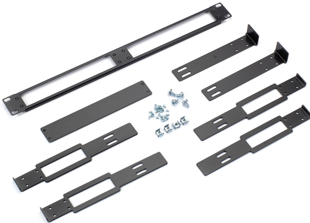
FIGURE 2-1. WHAT'S INCLUDED IN THE PACKAGE