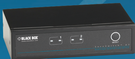
KV9612A: front view