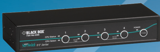
KV9614A: front view