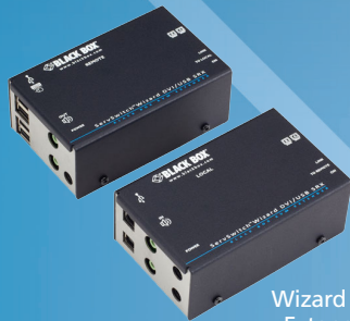
Wizard SRX DVI Extender USB (ACU5502A-R3)