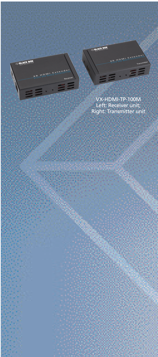
VX-HDMI-TP-100M Left: Receiver unit; Right: Transmitter unit