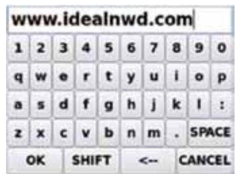
Virtual Keyboard allows easier and much faster data inputs.