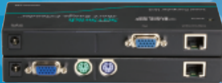
ACU075A-PS2: back view: top: Computer Unit; bottom: Console Unit