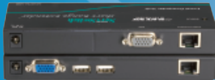
ACU075A-USB: back view: top: Computer Unit; bottom: Console Unit