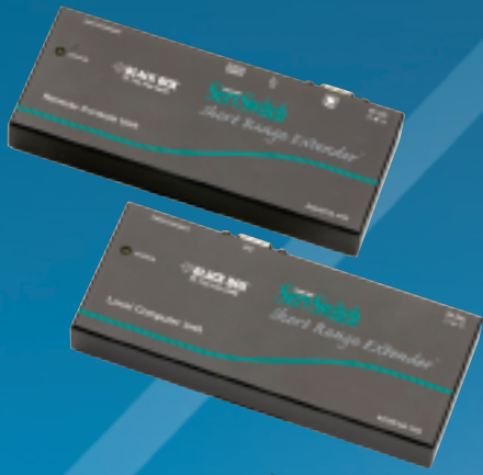
ACU075A-PS2: front view: top: Console Unit; bottom: Computer Unit

Resolution — 1280 x 1024 @ 23.4 m Connectors — ACU075A-USB: Console (Station) Unit: (1) HD15 F, (1) RJ-45, (2) USB Type A F, (1) barrel connector; Computer Unit: (1) HD15 F, (1) RJ-45, (1) barrel connector; ACU075A-PS2: Console (Station) Unit: (1) HD15 F, (1) RJ-45, (2) 6-pin mini DIN, (1) barrel connector; Computer Unit: (1) HD15 F, (1) RJ-45, (1) barrel connector Indicators — ACU075A-USB, ACU075A-PS2: Console (Station) Unit: (1) On LED; Computer Unit: (1) On LED Power — External 9-VDC, 600 mA power supply Dimensions — 2H x 15.6W x 6.5D cm Weight — Each transmitter or receiver unit: 0.3 kg