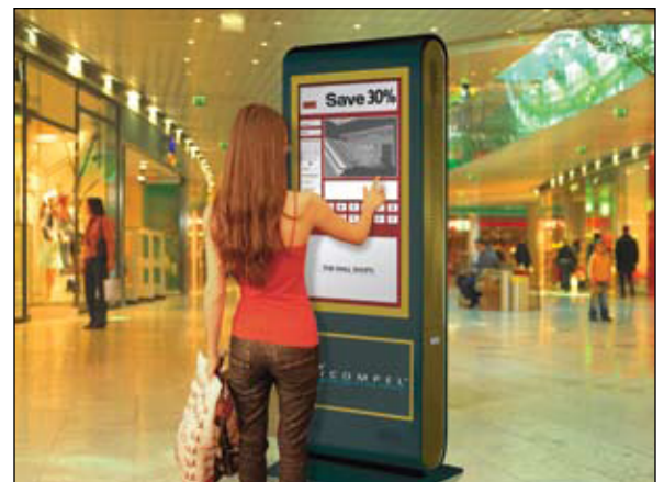
Digital signage can be used to get the attention of passersby, share information, and enhance the retail experience.

Hospitality: Hotel guests, especially business travellers, demand information to guide them in unfamiliar locales. Digital signage does wonders at delivering relevant and helpful information to guests in a hurry and even enables hotels to customise content for arriving groups or individuals. It's used to promote restaurant and bar offerings, sell profitable services (massage, concierge, dry cleaning, etc.), and publicise the location of meeting and fitness rooms and pool hours—thereby reducing the number of calls to the front desk. It also keeps guests informed of offerings outside the hotel, generating a separate stream of revenue through advertising for local restaurants, tour groups, limo and shuttle services, and local attractions, as well as paid content relating to trade shows.