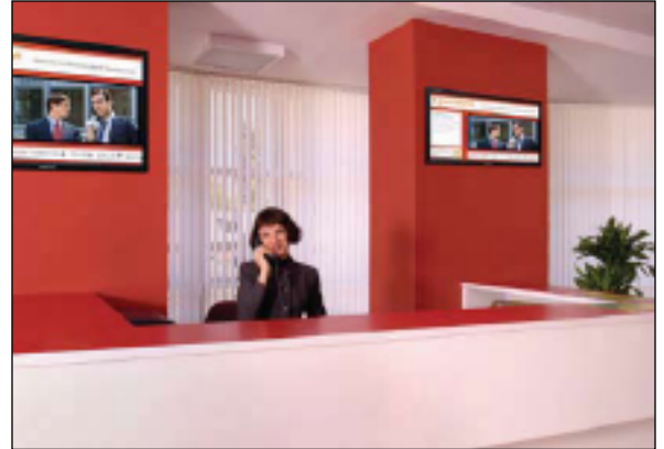
Digital signage can help communicate with employees, sharing information about upcoming programs, boosting morale, and recognising achievements.

For No. 3, measurability is easy. The advertising model provides a built-in set of metrics that allow a deployer to determine how well the signage initiative is working: advertising sales. For the other five, though, the business case is a bit tougher. Brand messaging and entertainment/customer engagement are long-term endeavors that are not as easily measured; both work on a psychological level with the customer, and the results might not be noticeable for some time, if ever.