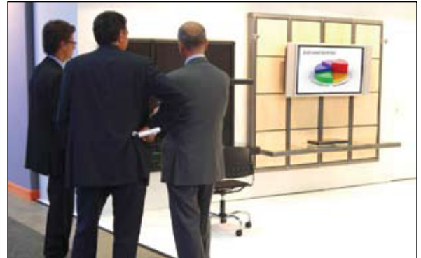
Content is still king—to engage audiences, it needs to be relevant to the people watching it.