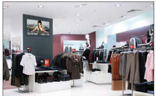
Stores can benefit from digital signage by using it for brand enhancement as well as selling ads on the network for products in the store.