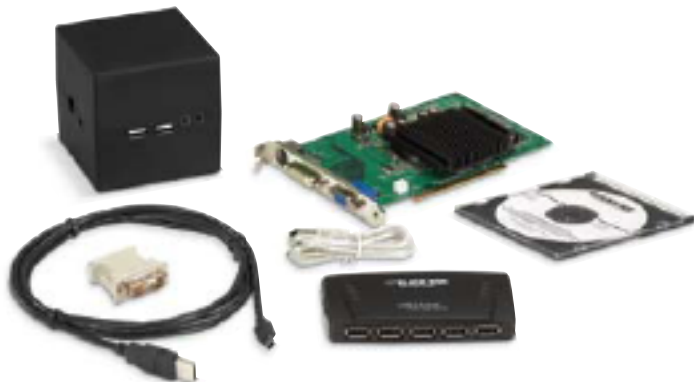
The VirtuaCore Computer Sharing system includes the Cube, a 4-port USB hub, a PCI video card, an adapter, cables, and an installation CD-ROM.

*NOTE: In the low-profile case, a fourth slot is required to accommodate the PCIe16 ribbon cable connector.