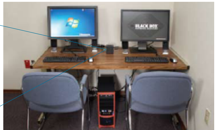
VirtuaCore 2-User Cube (VC002A), in middle of desk, enables one CPU to power two separate and fully functioning workstations with their own monitors, keyboards, and mice.