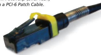
right: Yellow PatchClip (EVEPTS21) inserted on a PCI-6 Patch Cable.